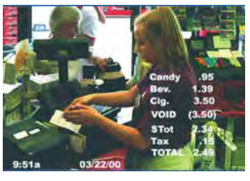
Video surveillance can be targeted and activated for selected workstation and POS terminal activity.