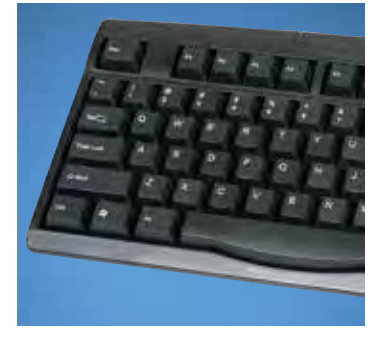
Use an SD card or USB thumb drive for Program Save/Load, report or screen capture, firmware updates and graphics uploading. Connect a keyboard to make programming quick and easy.