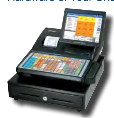
SAM4s SAP-630 FT Flat Spill-Resistant Keyboard; 3" Receipt Printer