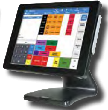
SAM4s SAP-6600 Touch Screen Terminal