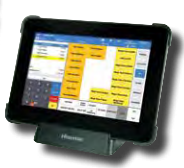
Hisense HM616 Android Tablet