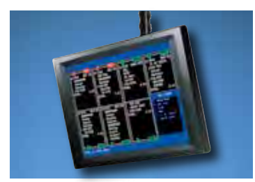
The E-PAD Video Controller provides a powerful way to speed service and increase employee productivity.