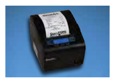
The SAM4s Ellix 40 high speed thermal printer can print requisitions for your kitchen or preparation area.