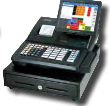
SAM4s SAP-630 RT Raised-Key Keyboard; 3" Receipt Printer